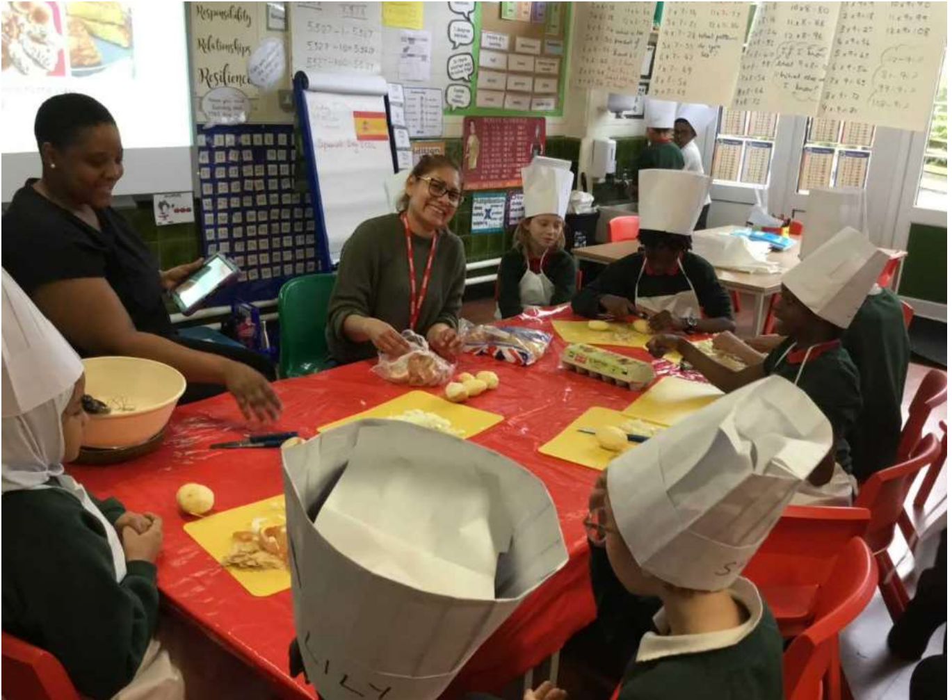
Year 3/4 Birch Class made a Spanish tortilla with a Spanish parent volunteer.